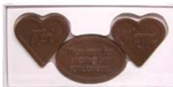
Hearts and shield $3.95 ea Box 175mm x 85mm