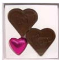
Twin hearts $3.95 ea Box 110mm x 110mm