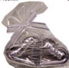
2 foiled name hearts $3.00 Approx 50mm each