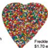
Freckle Heart $1.70 each