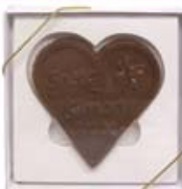
Single heart $ 3.65 ea Box 110mm x 100mm