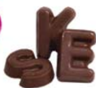
Letters $0.40 each