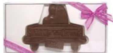
Just Married $ 3.95 ea Box 175mm x 85mm