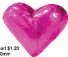
Large Heart $1.20 Approx 60mm