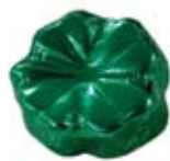
Four Leaf Clover