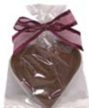
Single Heart $3.00 ea Approx 80mm