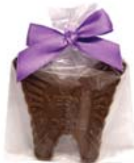
Butterfly $3.00 ea Approx 80mm