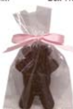
Teddy Bear $3.00 ea Approx 80mm