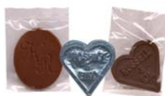
Initial/name shield or heart $1.00 ea (foiled or heat sealed bag only) Approx 50mm each