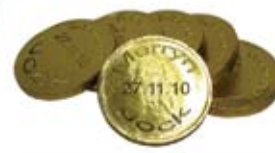
Custom stamped chocolate coins Single or Double Sided $0.40 40mm diameter

Designer Chocolates has literally thousands of stock moulds on hand covering almost any theme you can think of.