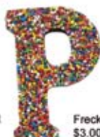
Freckletters $3.00 each